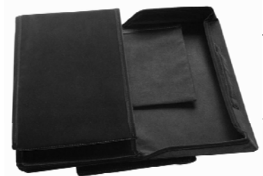
The steps arrive flat

Close each step cover and make sure the hook and loop fasteners on the sides and front of each step are connected to the cover. Each compartment can be used to store almost anything – dog toys, grooming tools, etc.